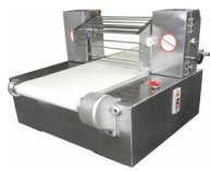
Multi-Layer Cake Slicer or Bun Slicer