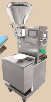
Automatic Rotary Cake Depositor GCG-RCD