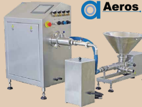
Small Aeration System A30