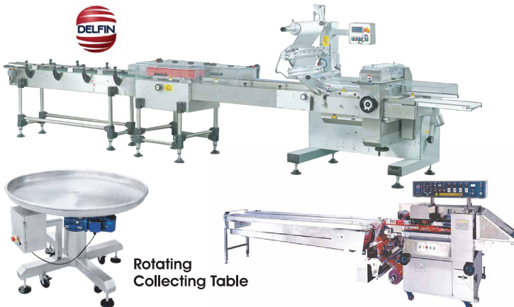
Rotating Collecting Table