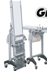
Enrobing Belt Conveyor NR400S