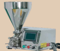
Injection Depositor GCG-CLBM

For injecting filling into donuts, cream puffs and more