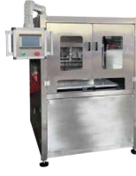
Ultrasonic Cross Cutter and Slitting Machine