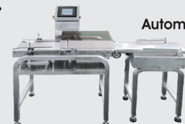
Automatic Check Weighing High-sensitivity, high-stability dynamic weight detection system, to ensure quality standards.