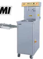
Enrobing and Melting Machine R400