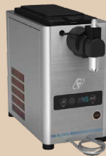
KING Cream whippers