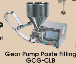
Gear Pump Paste Filling GCG-CLB