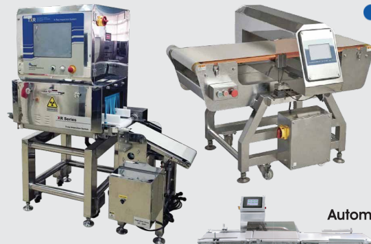
X-Ray Inspection System Specifically designed to detect unwanted physical contaminants within food

Metal Detector For detecting metal contaminants in products