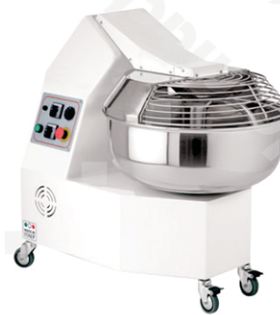
FC25 / FC35