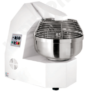
FC60 / FC80